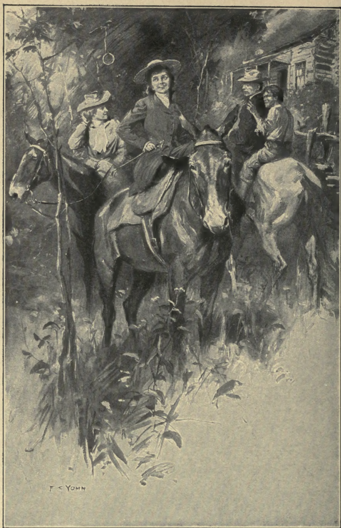
“Mart’s a-gittin’ ready for a tourneyment.”